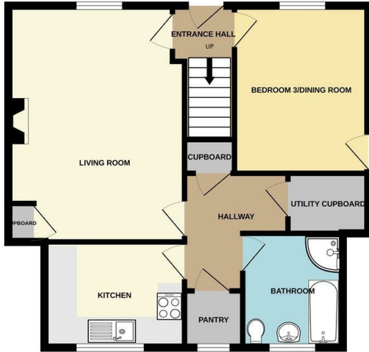
GROUND FLOOR 603 sq.ft. (56.0 sq.m.) approx.